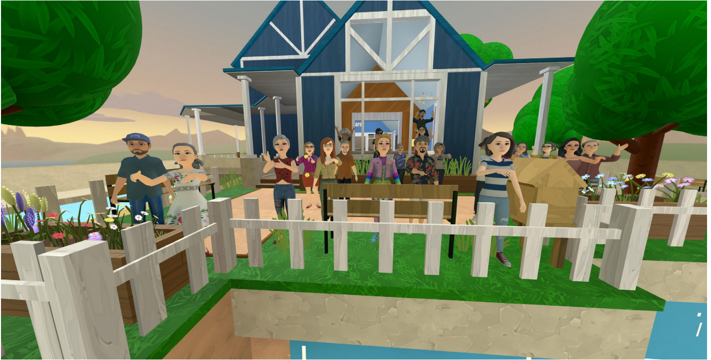
Plants! is a chill, cooperative VR game in Thrive Pavilion about growing plants, catching bugs, and unwinding in a stunning virtual greenhouse.